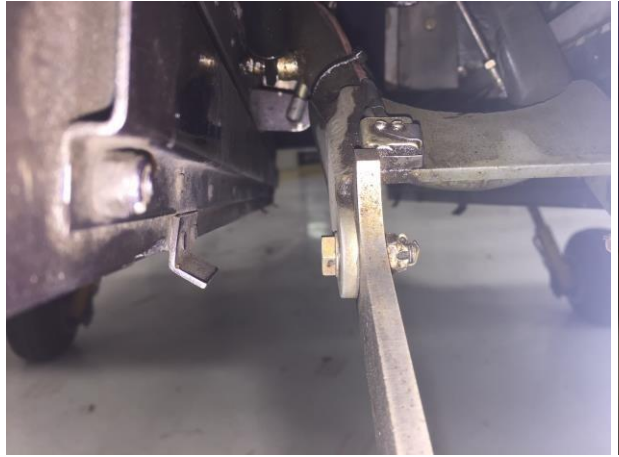
Figure 1 Original Design Lower Drag Links