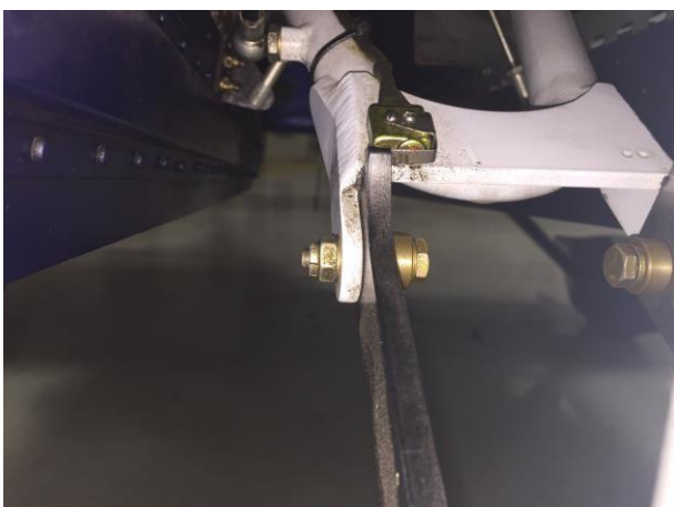
Figure 2 Improved Design Lower Drag Links